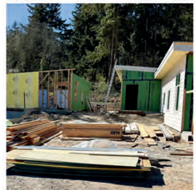
Progress at Landes Terrace