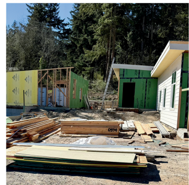
Progress at Landes Terrace